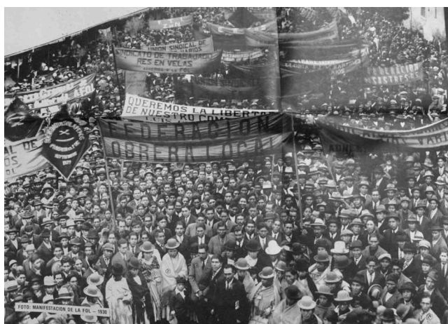
Figure 2. Anarchist rally in La Paz, 1930.

Part of the background to the alliance lies in the growth of anarchist organizing in La Paz over the prior two decades. Bolivian anarchism and Marxism both underwent substantial growth in the 1920s. While the line between the two was often blurry, anarchism was arguably the more influential prior to the war. It found especially strong support among the artisans, vendors, and employees in small-scale manufacturing who comprised the bulk of the pre-Chaco workforce in La Paz ( Figure 2 ). 15 Anarchist organizing reached a new level in 1927 with the foundation in La Paz of two anarchist labor federations, the FOL and a sub-federation, the Federación Obrera Femenina (Women Workers Federation, FOF). 16 Although repressed and temporarily decimated during the war, both federations re-emerged in 1935 and remained significant players on the left until the 1952 revolution, bucking the global trend of anarchism’s decline relative to Marxism. 17 As late as 1947, the FOL may have been the biggest labor federation in La Paz, largely due to the FAD’s affiliation, which more than doubled the FOL’s total numbers (Alexander 1947).