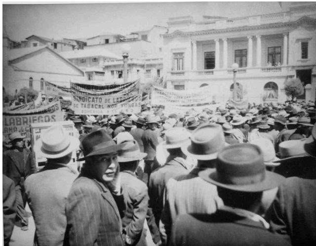
Figure 1. Anarchist rally in La Paz, 1 May 1947. The addition of rural affiliates in 1946–1947 more than doubled the total FOL membership. Note the presence of several banners mentioning labriegos, or rural laborers.